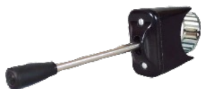
Indicator Switch ON/OFF/ON 121mm stalk