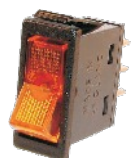
ON/OFF Narrow illuminated Rocker Switch Amber - K401. Green - K403 Blue - K402. Red - K404. 20amp 12v bulb 12mm x 30mm