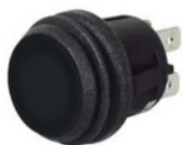
Push On/Push Off 0-690-51