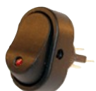
ON/OFF Rocker Switch with LED Amber - K471LED Red - K474LED Green - K473LED