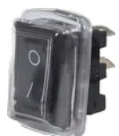
On/Off Single-Pole Rocker Switch with PVC Cover 19.5 x 13mm panel hole