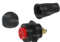
Heavy Duty Momentary Push Button With cover 180215